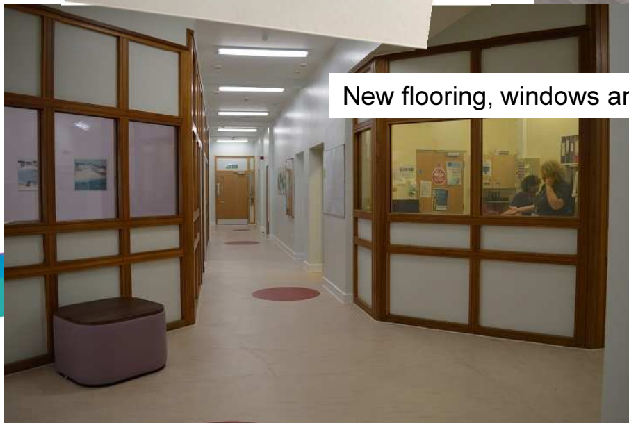
New flooring, windows and lighting