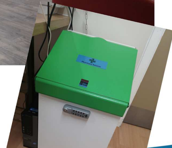
Improvements to medication disposal, labelling and the management of controlled drugs