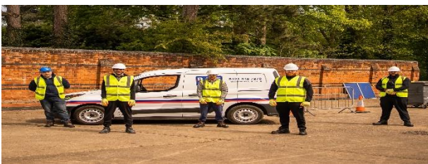
Candidates from the Lendlease and RMF Prison Academy.

Our Social Value Manager is also arranging some school visits as soon as we can safely accommodate them so that young people can see first hand the careers available in the Construction Industry. We are also working with Speakers for Schools to run a virtual insights day for young people across the East Midlands.