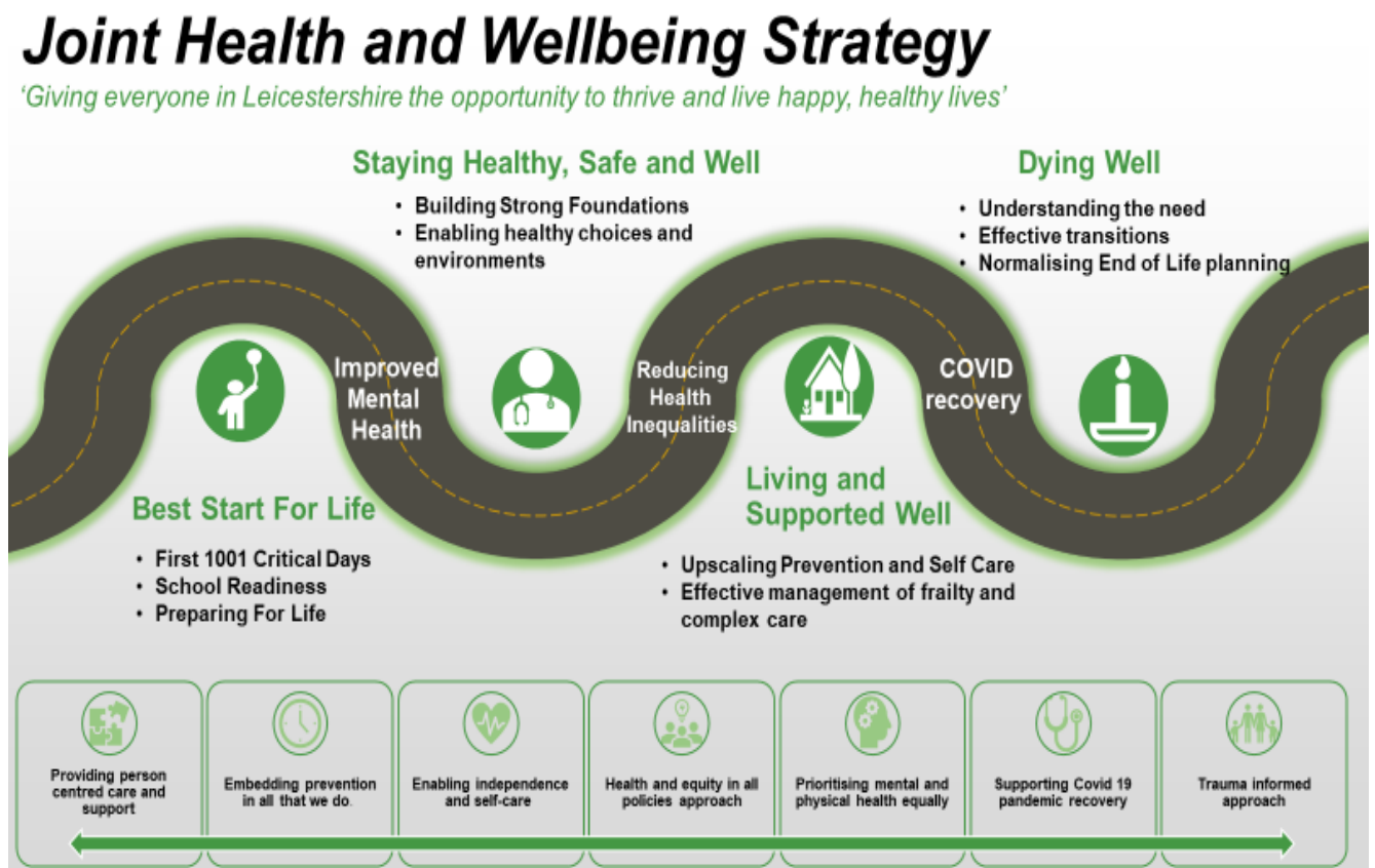
Figure 4 Summary of the Joint Health and Wellbeing Strategy

A life course approach has been used to identify high level strategic, multi-organisational priorities for the next 10 years and provide clear accountability to the Leicestershire health and wellbeing board. These are summarised in figure 4 below. Further detail on the actions associated with each priority are discussed in section 6.