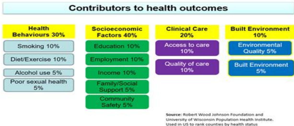
Figure 5 Contributors to health outcomes

of the causes', which will transform the population's health and help break cycles of intergenerational inequality. Key priorities to drive this change are detailed below.