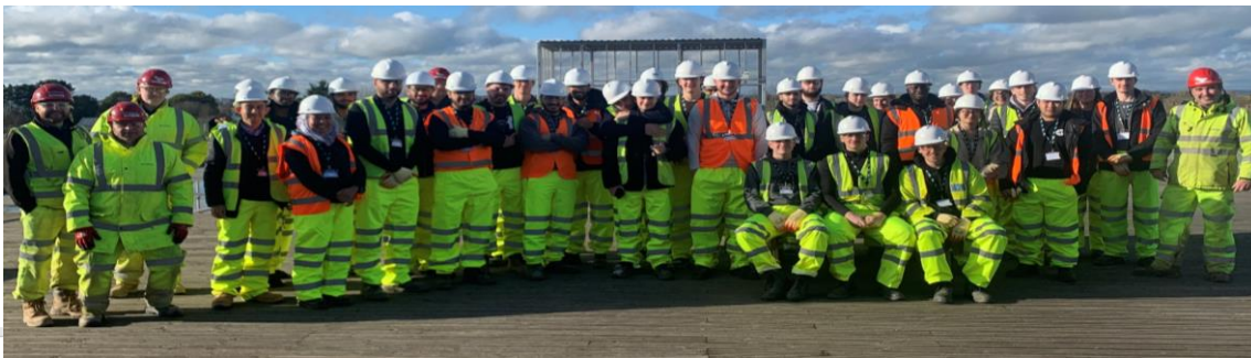
Visit from the students at Loughborough University

The team have also been busy hosting 23 students over a 3 week period, who have been undertaken a pre-introduction to T-Levels in construction work experience programme onsite at Fosse Way. The students, all from Leicester college have had a taster and insight into life onsite and what it is like to work on a major project. They have spoken to various trades onsite, helped with snagging, learnt about what it involves to plan a job like this from start to finish as well as undertaking pre-employability workshops on CVs and mock interviews. Some of the students were even tasked with redesigning a prison and making it as sustainable as possible – they had to consider what materials to use and how to embed green technologies.